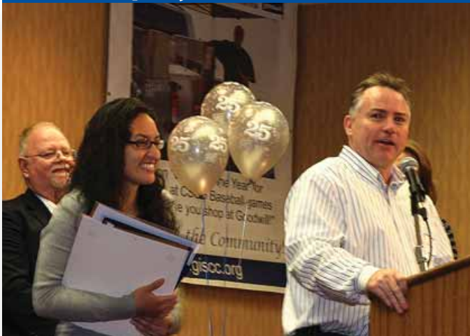
Account Control Technology