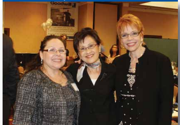
Community Clean Sweep